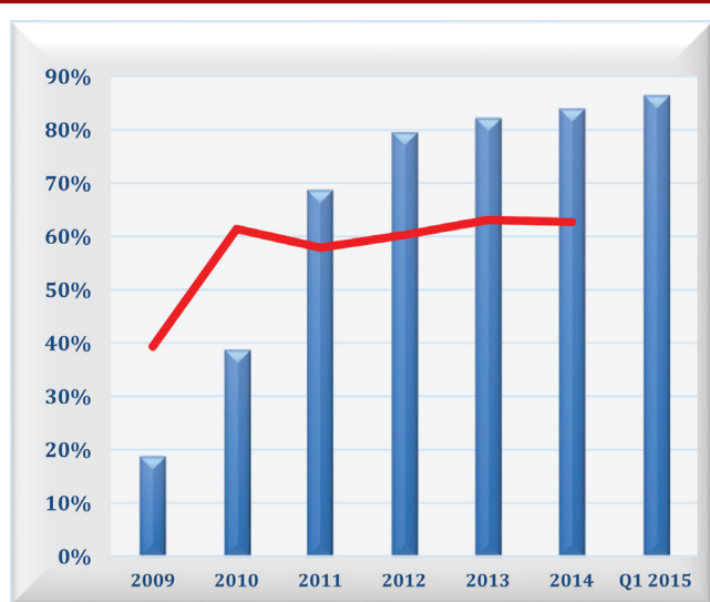
Figure 1: Biosimilar filgrastim market share

Bars show biosimilar filgrastim market share in volume. The line shows the average biosimilar filgrastim discount.